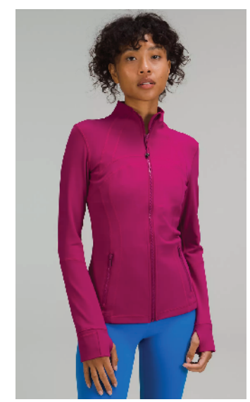
Designer Cost: $75-$120+ LuLaRoe: $64