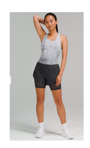
Designer Cost: $50-$75+ LuLaRoe: $35