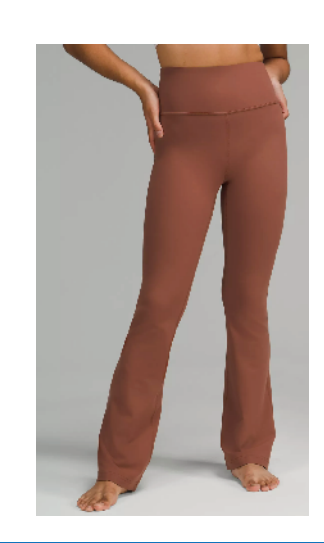
Designer Cost: $95-$110+ LuLaRoe: $52